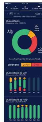
Sugar.IQ My Data Sample