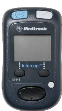
Medtronic Intercept(TM) patient programmer

The FDA-approved indication for epilepsy is as follows: Bilateral anterior thalamic nucleus stimulation using the Medtronic DBS System for Epilepsy is indicated as adjunctive therapy for reducing the frequency of seizures in individuals 18 years of age or older diagnosed with epilepsy characterized by partial-onset seizures, with or without secondary generalization, that are refractory to three or more antiepileptic medications. The Medtronic DBS System for Epilepsy has demonstrated safety and effectiveness in patients who averaged six or more seizures per month over the three most recent months (with no more than 30 days between seizures) and has not been evaluated in patients with less frequent seizures.