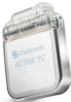
Medtronic Activa(TM) PC neurostimulator